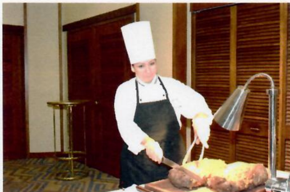
The Aloha Buffet features a Prime rib carving station.

Tentatively, the Go For Broke Association's Annual Membership Dinner Meeting is tentatively scheduled Saturday, May 8, 2021 at the Hale Koa Hotel's Waikiki Ballroom.