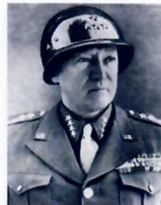
General George S. Patton Jr

"Wars may be fought with weapons, but they are won by men. It is the spirit of the men who follow and of the man who leads that gains that victory."