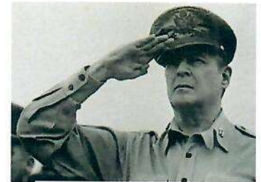
General Douglas MacArthur

“The soldier, above all other men, is required to practice the greatest act of religious training – sacrifice.”